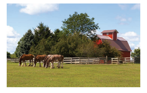
Farms, ranch, or stables

Monitor warehouses and deter unauthorized access around your business.