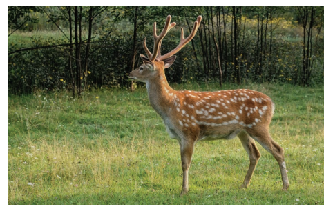
Trails and wildlife

Keep an eye on what matters most when you're not around, even when you're on the road.