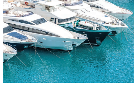
Boats, docks and marinas

Monitor your vacation home or rental property.