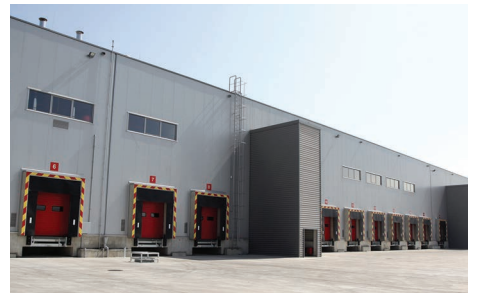
Warehouses and parking lots

Remotely monitor suspected criminal activity and high crime rate zones.