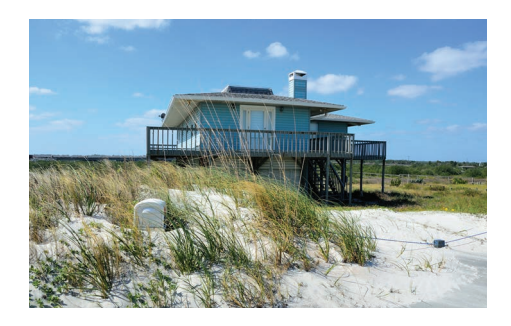
Airbnb and vacation rental monitoring

Keep an eye on employees or monitor your equipment even without WiFi coverage onsite.