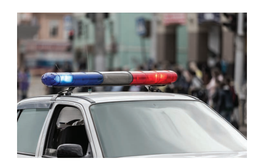
Law enforcement, military, or airline hangar security

You don't have to be in the forest to enjoy watching wildlife. You can see the outdoors from the comfort of your home.