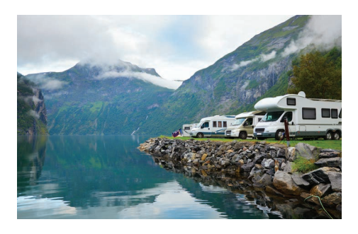
Hotels, vacation homes, campers, RVs, or trailers

Keep an eye on what matters most when you're not around, even when you're on the road.